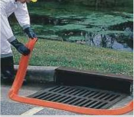
A person works to prevent a spill from entering a storm sewer (DAWG, 2000)

Identify potential spill or source areas, such as loading and