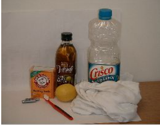
Examples of alternative products include rechargeable batteries, baking soda, olive oil, vegetable oil, a lemon, a toothbrush, and a rag

The promotion of safer alternative products should be coupled with other programs designed to reduce the presence of hazardous or toxic materials in homes and storm water runoff. Examples of such programs are hazardous materials collection, good housekeeping or