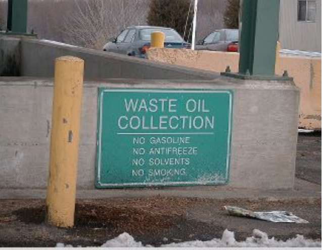
Used oil can be disposed of at a waste collection facility, where it will be collected and later sent to a recycling facility

Used motor oil is a hazardous waste because it contains heavy metals picked up from the engine during use. Fortunately, it is recyclable because it becomes dirty from use, rather than actually wearing out. However, as motor oil is toxic to humans, wildlife, and plants, it should be disposed of at a local recycling or disposal facility. Before disposal, used motor oil should be stored in a plastic or metal container with a secure lid, rather than dumped in a landfill or down the drain. Containers that previously stored household chemicals, such as bleach, gasoline, paint, or solvents should not be used. Used motor oil should also never be mixed with other substances such as antifreeze, pesticides, or paint stripper.