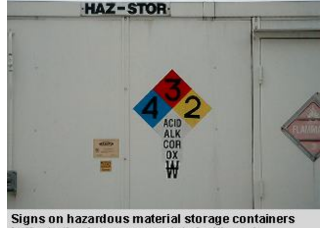
indicate the dangers associated with each substance

Hazardous material storage is relevant to both urban and rural settings and all geographic regions. The effects of hazardous material leakage may be more pronounced in areas